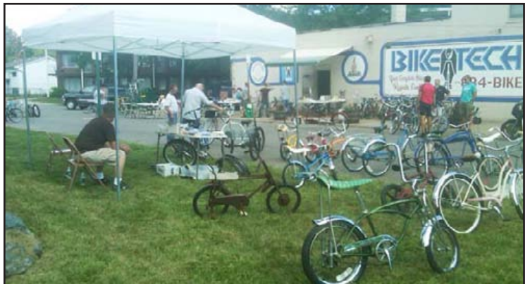
The third annual Road/Track Bicycle Show and Swap Meet was held at Balduck Park on Sunday, Aug. 28. Bike Tech and CEM Business Association co-sponsored the event.