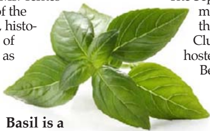
Basil is a favorite easy-to-grow herb.