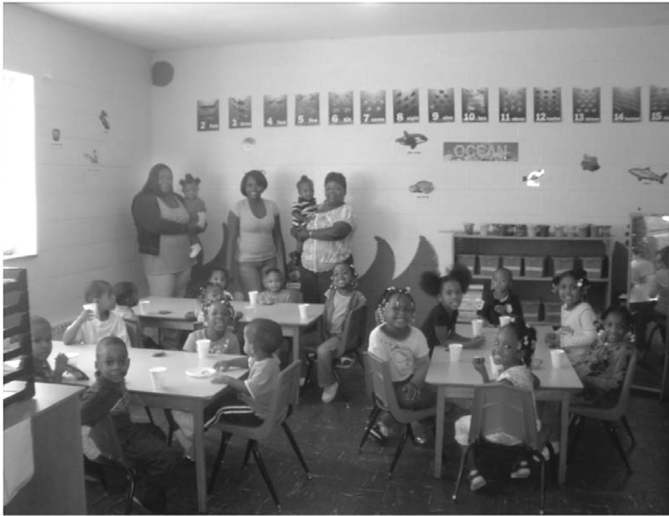
Peter Rabbit Early Learners

Peter Rabbit Early Learning Center Bethany Christian Church in East English Village Corner of Cadieux and Linville off I-94 313-882-7446