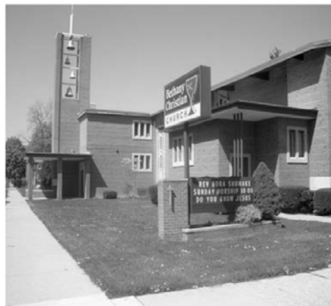
Bethany Christian Church